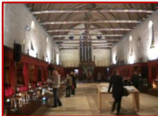
People come to visit the Museum 参观的人们