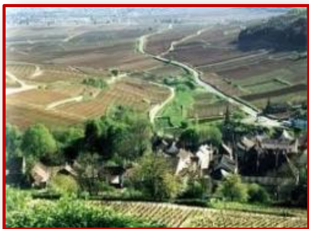
Burgundy's landscape 勃艮第地理风貌

The Burgundy region of France has been producing what are widely considered to be the world's finest Pinot Noirs and Chardonnays for nearly a thousand years.