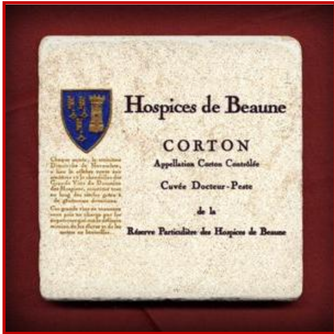
The label of Hospices de Beaune 's Cuvée Doctor Peste 主宫医院特酿的酒标