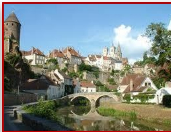
Typical Burgundy's Village 典型的勃艮第村落