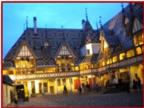
Hospices de Beaune 主宫医院夜景