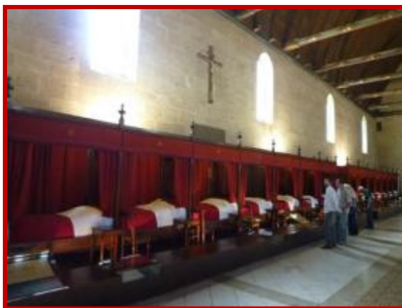
Hospital's beds today part of the museum, managed before by nuns 从前由修女们管理的主宫医院，现在已经转变为博物馆

Every year Hospices de Beaune make a charity auction only for professionals.