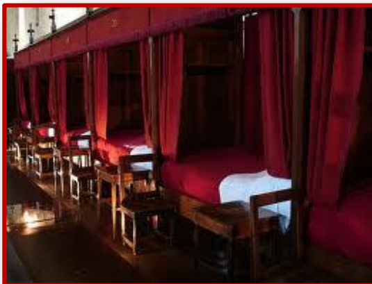
Museum: former Hospital 内部陈设