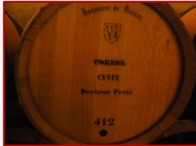
The wine that Oh Marco bided 噢马克酒窖拍得的酒