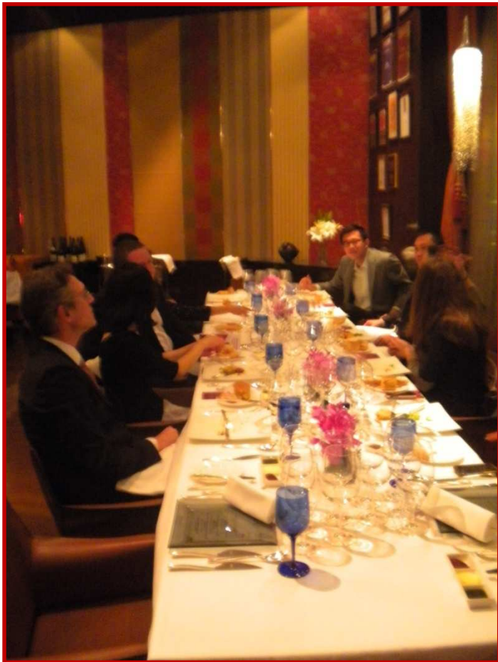
Wine dinner organized in Ritz Carlton Hotel 葡萄酒晚宴在丽思卡尔顿酒窖举行